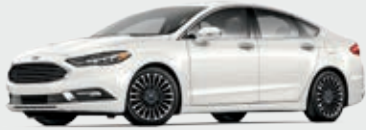
Titanium, Hybrid Titanium and Fusion Energi Titanium