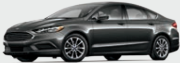
SE, Hybrid SE and Fusion Energi SE