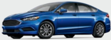
S and Hybrid S