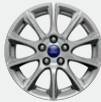
16" Painted Aluminum Standard: S