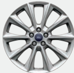
19" Polished Aluminum Standard: Platinum