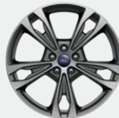
19" Premium Dark Stainless-Painted Machined Aluminum Optional: Titanium