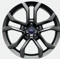
18" Dark Stainless-Painted Aluminum Included: S Appearance Package, SE Appearance Package, Hybrid SE Appearance Package