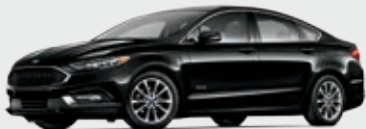
Platinum, Hybrid Platinum and Fusion Energi Platinum