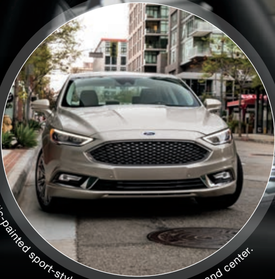
The Magnetic-painted sport-style grille puts Platinum front and center.

Every driver-assist technology Fusion offers is standard on Platinum. As is a Navigation System with SiriusXM® Traffic and Travel Link® to help guide you. Outside, Platinum distinction is marked by a Magnetic-painted sport-style grille, a power moonroof overhead, and 19" polished aluminum wheels 1 at the corners.