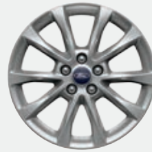
17" Luster Nickel-Painted Aluminum Standard: SE, Hybrid S, Hybrid SE, Fusion Energi SE, Fusion Energi Titanium, Fusion Energi Platinum Optional: S