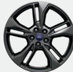
19" Premium Tarnished Dark-Painted Standard: V6 Sport