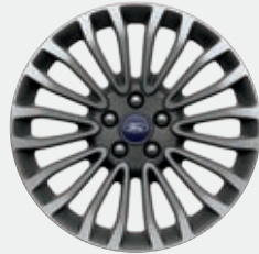
18" Machined Face Aluminum with Painted Pockets Standard: Titanium, Hybrid Titanium, Hybrid Platinum Available: SE, SE Hybrid Optional: Fusion Energi SE, Fusion Energi Titanium, Fusion Energi Platinum